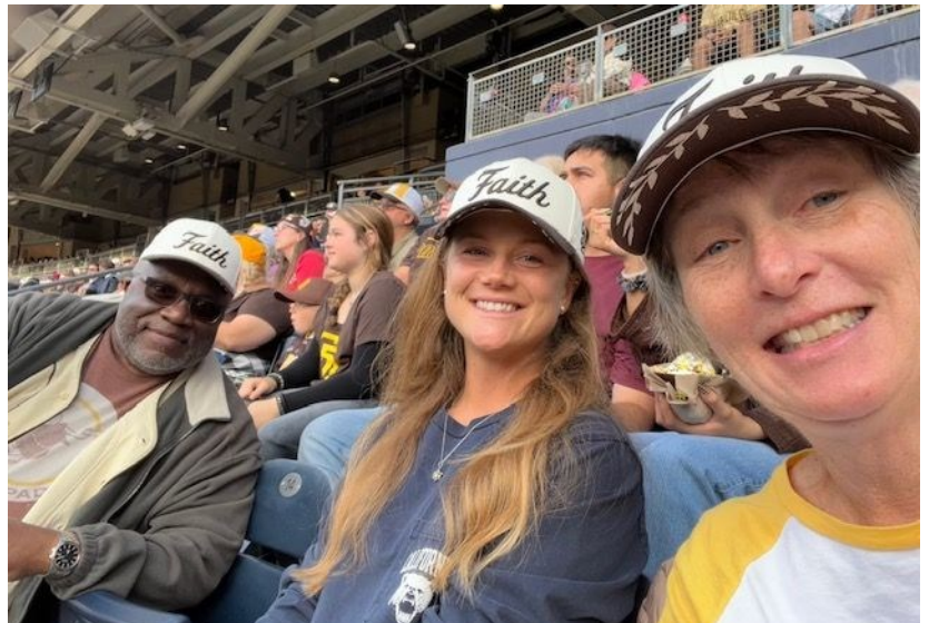
Several PB UMC members went to Petco Park for the Padres' "Faith and Family" Night. Unfortunately, the Padres lost. :(