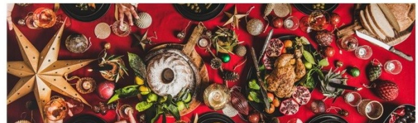
CCSA Christmas Baskets for 2025

We are once again collecting non-perishable food items and a gift card for Christmas food baskets for low-income families. If you would like to shop for requested food items and bring them to the collection box in the church lobby, here are the suggestions: