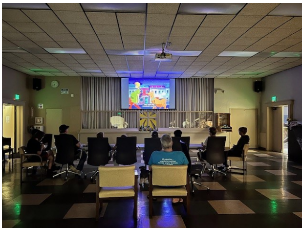
Last month, PB UMC hosted the PB Youth Turn Up, which featured the screening of a Scooby Doo movie.