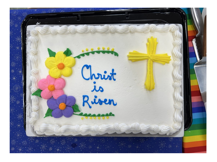
2024 Easter Cake