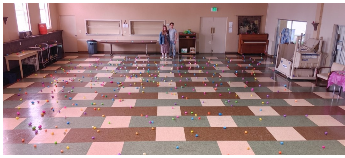
Hughes Hall pre-Easter Egg Hunt