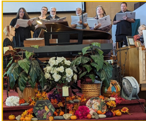
Voices of Praise on Laiety Sunday

Thank you for your generosity in prayers, presence, gifts, service, and witness! So many of you have come up with creative ways to support the work of the church, whether that be financially or through other ways of giving. May God always be in our hearts and minds and lead our intentions as we continue using our resources wisely, trusting in God who provides. Thank you for your faithfulness and support for the mission and ministries of PB UMC!