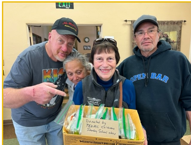
Hygiene kits made by our Sunday School Kids