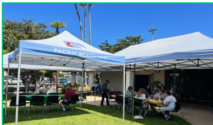
Our First Block Party October 8, 2023

Sun, Nov 5 Daylight Savings Time Ends 9:30 am, Prayer Circle 10:00 am, All Saints Sunday Holy Communion Deposit for LJ UMC Women's Retreat Due Mon, Nov 6 6:00 pm, Al-Anon Tues, Nov 7 9:30 am, Prayers and Squares Quilt Group 6:00 pm, Choir Practice 7:00 pm, District Monthly Prayer Group Wed, Nov 8 7:00 am, AA 11:30 am, Scripture & Sermon Study 4:00 pm, SD Project Grace Thurs, Nov 9 Noon, Lunch Bunch (p. 4) 6:30 pm, Hymn Sing and Dessert Potluck (p. 4) Sat, Nov 11 Veterans Day 10:00 am, Al-Anon