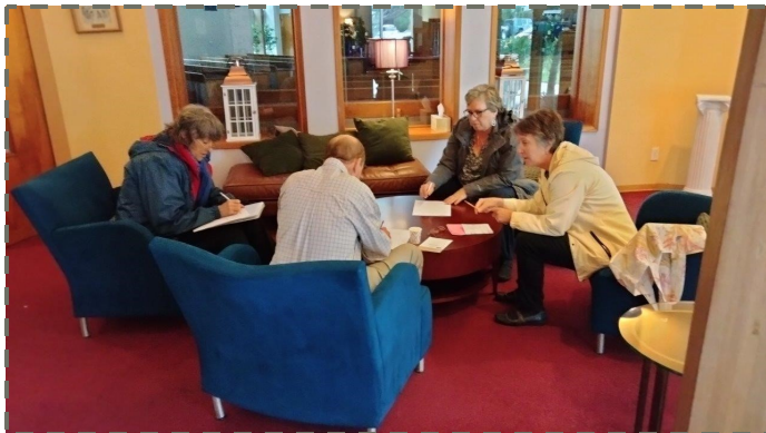
SPRC Focus Group

Sun, Mar 5 9:30 am, Prayer Circle 10:00 am, Worship and Communion Mon, Mar 6 6:00 pm, Al-Anon Tues, Mar 7 6:00 pm, Choir Wed, Mar 8 11:30 am, Scripture & Sermon Study 4:00 pm, SD Project Grace Thurs, Mar 9 6:30 pm, Lenten Study 7:00 pm, Narc Anon Sat, Mar 11 10:00 am, Al-Anon