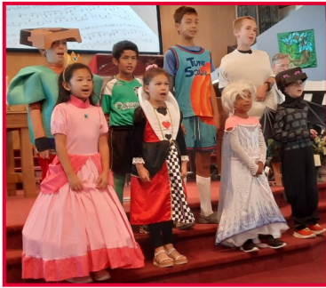
October 30, 2022 Our Young Trick-or-Treaters

Thurs, Dec 1 6:00 pm, PB Holiday Float Prep 7:00 pm, Narc Anon Fri, Dec 2 6:00 pm, PB Holiday Float Prep Sat, Dec 3 10:00 am, Al-Anon 2:00 pm, Hanging of the Greens in the Sanctuary (p. 1) 6:00 pm, PB Holiday Float Prep