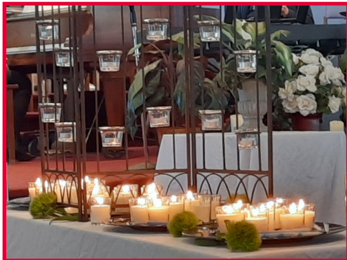
Nov 6, 2022 All Saints Sunday

October was a positive month for income minus expenses. We received an IRS refund check for $8,949 in November. It doesn't show in the October numbers but it will help us catch up with our expenses.