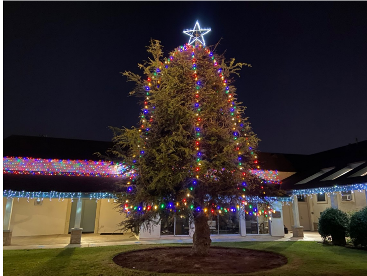
PB UMC Lights December 2022