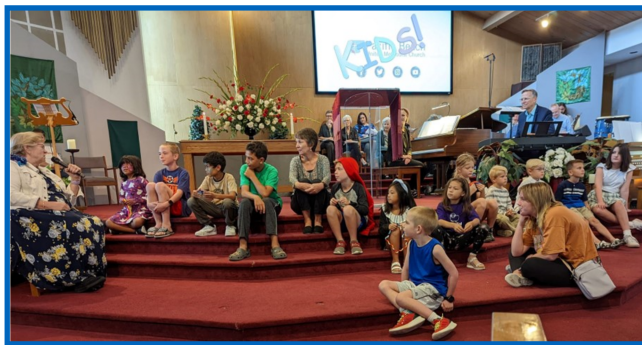
October 23, 2022 Our Kids in Worship