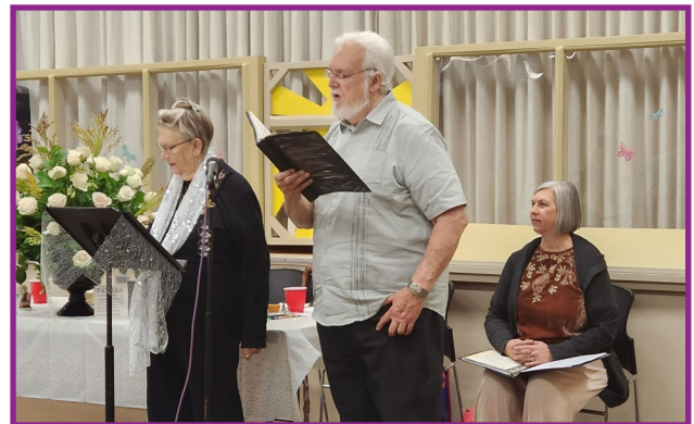
Nov 20, 2022 Walker 60 th Anniversary SingAlong