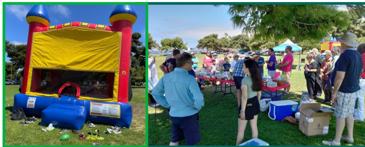
PB UMC Picnic, August 28, 2022

Sun, Oct 2 9:00 am, Coffee & Cards Ministry 9:30 am, Prayer Circle 10:00 am, Worship 2:00 pm, Blessing of the Animals (p.2) Mon, Oct 3 6:00 pm, Al-Anon Tues, Oct 4 10:00 am, Prayers and Squares Quilt Group 6:00 pm, Choir Practice 7:00 pm Nominating and Leadership Development Committee 7:00 pm, So District Prayer Meeting Wed, Oct 5 11:30 am, Scripture & Sermon Study 4:00 pm, SD Project Grace Sat, Oct 8 10:00 am, Youth & Young Adults (p.3) 5:00 pm, Fall Festival/Spaghetti Dinner (p.4)