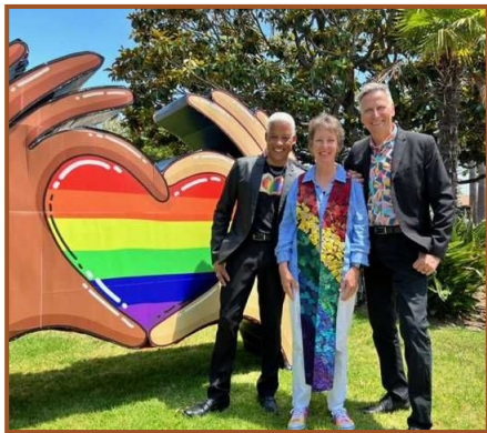
Top From Our PB UMC PRIDE Float, July 16 2022

Sun, Sept 4 9:00 am, Coffee & Cards Ministry 9:30 am, Prayer Circle 10:00 am, Outdoor Church Labor of Love Celebration (p.5) Mon, Sept 5 Labor Day Church Office Closed 6:00 pm, Al-Anon Tues, Sept 6 10:00 am, Prayers and Squares Quilt Group 6:00 pm, Choir Practice 7:00 pm, So District Prayer Meeting Wed, Sept 7 11:30 am, Scripture & Sermon Study 4:00 pm, SD Project Grace Thurs, Sept 8 7:00 pm, AA