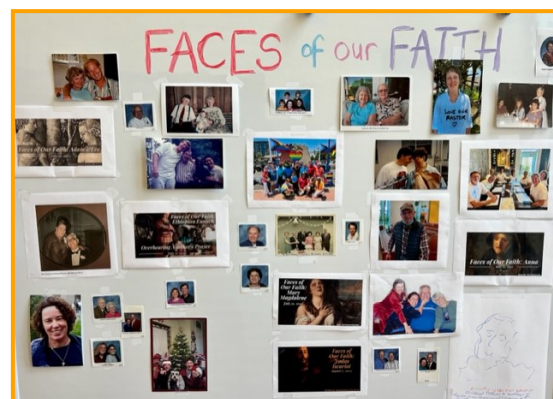
Congregation Responses to the "Faces of Our Faith" Sermon Series for July- August 2022

Sun, Sept 25 9:30 am, Prayer Circle 10:00 am, Worship 11:30 am, Antidote to Violence (p.1) 6:00 pm, Movie Night (p.5) Mon, Sept 26 Beach Breeze Posted Online 6:00 pm, Al-Anon Tues, Sept 27 6:00 pm, Choir Practice Wed, Sept 28 11:30 am, Scripture & Sermon Study 4:00 pm, SD Project Grace 5:30 pm, Storefront Ministries Thurs, Sept 29 7:00 pm, AA