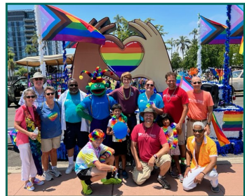
Our PB UMC PRIDE Float and Volunteers, July 16 2022

Sun, Aug 14 9:30 am, Prayer Circle 10:00 am, Worship 2:00 pm, Memorial Service for Frank Glaser Mon, Aug 15 6:00 pm, Al-Anon Tues, Aug 16 10:00 am, Prayers and Squares Quilt Group 6:00 pm, Choir Practice Wed, Aug 17 11:30 am, Scripture & Sermon Study 4:00 pm, SD Project Grace 7:00 pm, Lectio Divina Series (p.2) Thurs, Aug 18 7:00 pm, AA