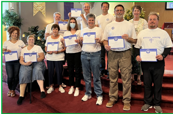
Stephen Ministry Induction June 26 , 2022

Mon, Aug 1 6:00 pm, Al-Anon Tues, Aug 2 10:00 am, Prayers and Squares Quilt Group 6:00 pm, Choir Practice 7:00 pm, So District Prayer Meeting Wed, Aug 3 11:30 am, Scripture & Sermon Study 4:00 pm, SD Project Grace Thurs, Aug 4 7:00 pm, AA Fri, Aug 5 1:00 pm, Lectio Divina Series (p.2)