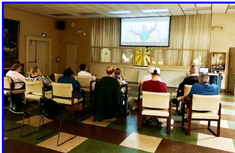
Movie Night May 22, 2022 "The Great Race"

Sun, Jul 3 9:30 am, Prayer Circle 10:00 am, Worship and Communion Mon, Jul 4 Independence Day (Church Office Closed) 6:00 pm, Al-Anon Tues, Jul 5 10:00 am, Prayers and Squares Quilt Group 6:00 pm, Choir Practice 6:00 pm, Float Construction 6:00 pm, Choir Practice 7:00 pm, So District Prayer Meeting Wed, Jul 6 11:30 am, Scripture & Sermon Study 4:00 pm, SD Project Grace 6:00 pm, Float Construction Thurs, Jul 7 1:00 pm, Coffee with Friends 6:00 pm, Float Construction 7:00 pm, AA