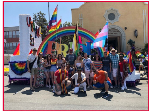
PB UMC Pride Parade Float (Before Covid-19)

Sun, Jul 10 9:30 am, Prayer Circle 10:00 am, Worship Mon, Jul 11 6:00 pm, Al-Anon Tues, Jul 12 6:00 pm, Choir Practice 6:00 pm, Float Construction Wed, Jul 13 11:30 am, Scripture & Sermon Study 4:00 pm, SD Project Grace 6:00 pm, Float Construction Thurs, Jul 14 10:00 am Day at the Beach (p.3) 1:00 pm, Coffee with Friends 6:00 pm, Float Construction 7:00 pm, AA Friday, Jul 15 6:00 pm, Float Construction Sat, Jul 16 Pride Parade "Justice With Joy" (p.5)