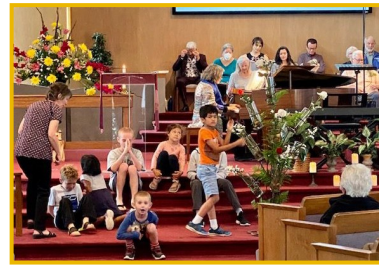
Remembering Mothers in Worship Service, May 8, 2022

Sun, June 12 Trinity Sunday 9:30 am, Prayer Circle 10:00 am, Worship Sunday School and Nursery Care 11:00 am, Youth Luncheon (p.3) 3:00 pm, Games and 6:00 pm Movie (p.4) Mon, June 13 6:00 pm, Al-Anon Tues, June 14 Flag Day 6:00 pm, Choir Practice Wed, June 15 11:30 am, Scripture & Sermon Study Cal-Pac Business Meeting via Zoom 4:00 pm, SD Project Grace Thurs, June 16 1:00 pm, Coffee with Friends 7:00 pm, AA Friday, June 17 Cal-Pac Ordination and Celebrations and in Person, Costa Mesa Sat, June 18 (p.1)