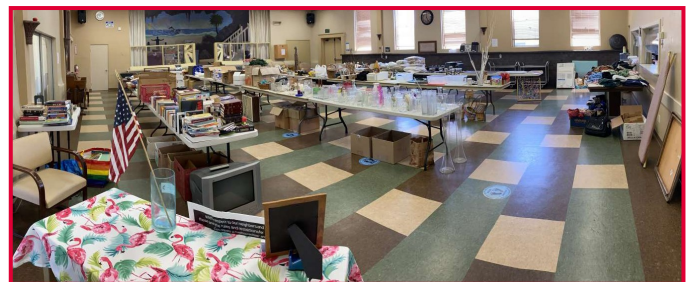
PB UMC Rummage Sale May 14-15, 2022.

Sun, June 19 Fathers' Day Juneteenth 9:30 am, Prayer Circle 10:00 am, Worship Sunday School and Nursery Care Mon, June 20 Beach Breeze Deadline 6:00 pm, Al-Anon Tues, June 21 10:00 am, Prayers and Squares Quilt Group 6:00 pm, Choir Practice 6:30 pm, Church Council Meeting via Zoom Wed, June 22 11:30 am, Scripture & Sermon Study 4:00 pm, SD Project Grace 5:30 pm, Storefront Ministries Thurs, June 23 1:00 pm, Coffee with Friends 7:00 pm, AA