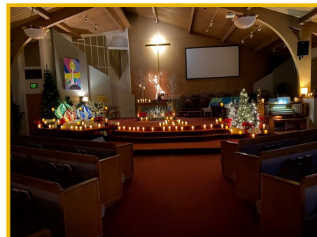
Christmas Eve Candlelight Service December 24, 2021

Sun, Jan 23 9:00 am, Children and Family Sunday School 10:00 am, Worship In Person and Online Child Care Available 11:15 am, Growing in Faith Mon, Jan 24 February Beach Breeze Posted Online 6:00 pm, Al-Anon Tues, Jan 25 6:00 pm, Choir Practice Wed, Jan 26 11:30 am, Scripture & Sermon Study 4:00 pm, SD Project Grace 5:30 pm, Storefront Ministries Thurs, Jan 27 1:00 pm, Coffee with the Pastor Fri, Jan 28 6:00 pm, Narc Anon