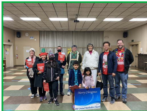
Caroling in the Neighborhood Sunday, December 12, 2021

Sun, Jan 2 9:00 am, Children and Family Sunday School 10:00 am, Worship and Communion In Person and Online Child Care Available Mon, Jan 3 6:00 pm, Al-Anon Tues, Jan 4 10:00 am, Prayers and Squares Quilt Group 6:00 pm, Choir Practice Wed, Jan 5 11:30 am, Scripture & Sermon Study 4:00 pm, SD Project Grace Fri, Jan 7 6:00 pm, Narc Anon