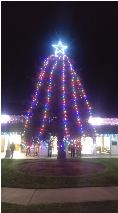
Tree Lighting and Caroling in Our Courtyard. November 29, 2020

Worship Times 9:00 am, Worship Celebration Via Livestream