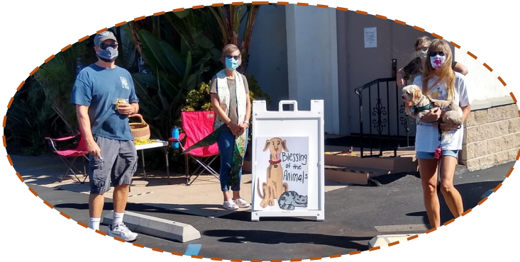
October 11, 2020

Sun, Nov 8 9:00 am, Worship 10:00 am, Post-Worship Coffee Hour 4:00 pm, Youth Group (p.3) Mon, Nov 9 6:30 pm, Esther Study Tues, Nov 10 6:30 pm, Church Council Meeting Wed, Nov 11 Veterans Day 11:30 am, Scripture & Sermon Study Online 4:00 pm, SD Project Grace Thurs, Nov 12 1:00 pm, Coffee with the Pastor 7:00 pm, Choir Practice, via Zoom