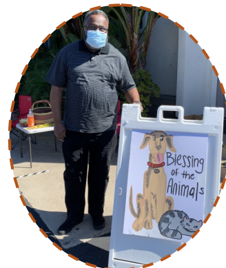
Sunday, October 11, 2020

Sun, Nov 29 9:00 am, Livestream Worship 10:00 am, Post-Worship Coffee Hour Mon, Nov 30 December Beach Breeze Posted Online