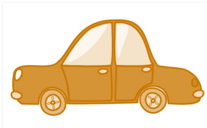
Sunday, September 20, 2020