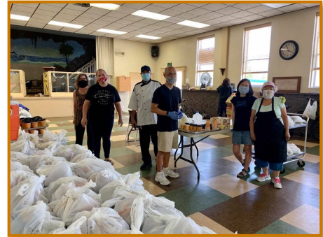
All photos this page: Project Grace Volunteers and Packets