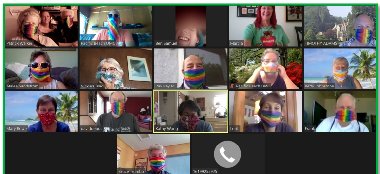
Pride Sunday Zoom July 19, 2020 (Thank You, Mask Elves!)