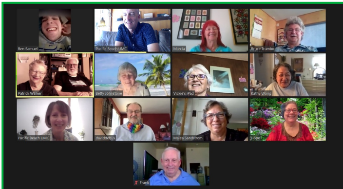
PB UMC Virtual Coffee Hour