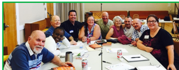
VUE Team Photo From April 2015 Beach Breeze