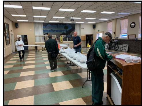
Preparing Take-Out Meals for Project Grace, March 26, 2020

Sun, Apr 19 Worship 9:00 am, LiveStream Mon, Apr 20 May Beach Breeze Deadline Wed, Apr 22 11:30 am, Scripture & Sermon Study Online 5:30 pm, SD Project Grace 5:30 pm, Storefront Ministries