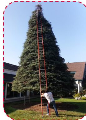
Our Courtyard Tree 2018

Sun, Dec 1 Worship and Communion 10:00 am, Children's Choir (p.4) 8:30 am-noon, Christmas Boutique (p.3) 4:00 pm, Advent Kick-Off and Potluck (p.1) 5:00 pm, Advent Small Group (p.3) Mon, Dec 2 6:00 pm, Al-Anon Wed, Dec 4 11:30 am, Scripture & Sermon Study 5:30 pm, SD Project Grace Thurs, Dec 5 7:00 pm, Choir Rehearsal Fri, Dec 6 7:30 pm, Narc Anon Sat, Dec 7 9:00 am, Prayers & Squares Quilters