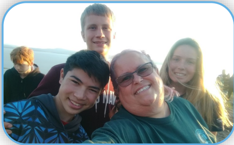
2019 Sierra Service Project Spirit Walk