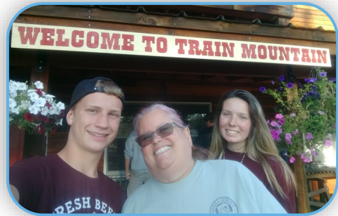
2019 Sierra Service Project Train Mountain