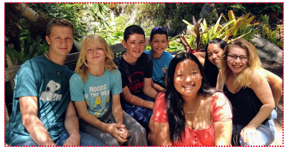
Youth at San Diego Botanical Garden July 2, 2019