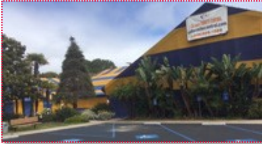
Termite Treatment June 20-22, 2019