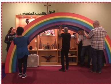
Assembling the Rainbow PB UMC Pride Float