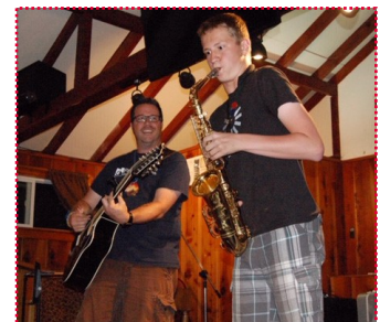
Camp Cedar Glen Senior High Camp Talent Show