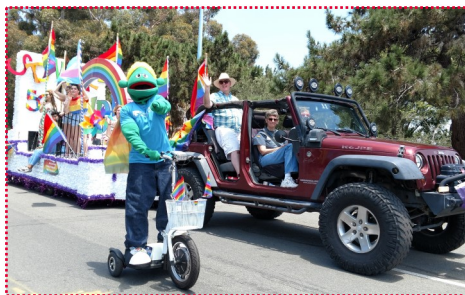
PB UMC Pride Float