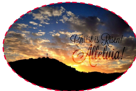
2019 Easter Worship Service Screen