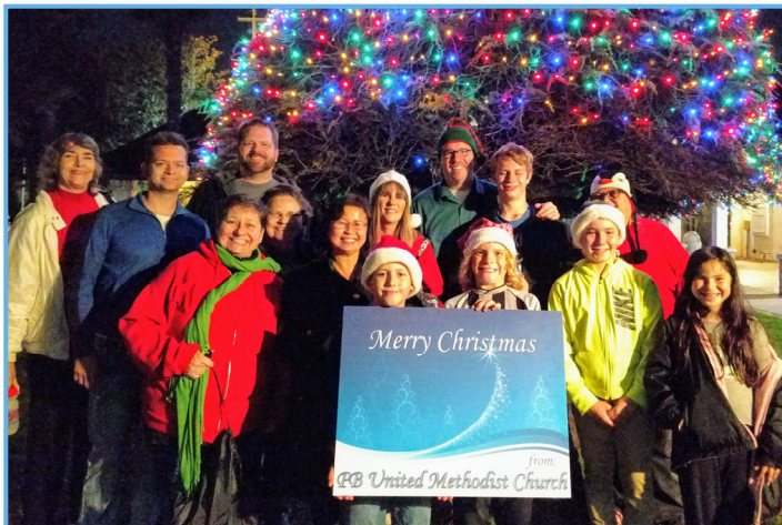
2018 Christmas Caroling

Pictured here are our volunteers helping to compile the baskets.