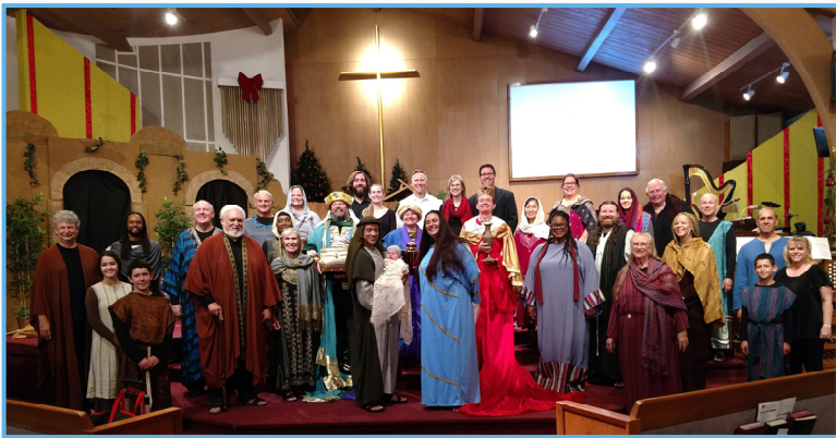
2018 Christmas Musical Cast: Two From Galilee

Sun, Jan 27 Worship Noon, Youth Activity (p.4) Mon, Jan 28 5:30 pm, Bible Study (Scripture & Sermon) 6:00 pm, Al-Anon Wed, Jan 30 11:30 am, Scripture & Sermon Study 5:30 pm, SD Project Grace Thurs, Jan 31 7:00 pm, Choir Rehearsal