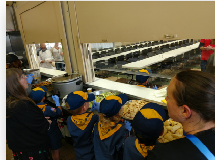
Boy Scouts Helping Serve Wednesday Night Dinner

Sun, June 10 Worship Mon, June 11 6:00 pm, Al-Anon Tues, June 12 6:00 pm, Staff Parish meeting 6:30 pm, Trustee meeting 7:30 pm, Finance Committee Wed, June 13 11:30 am, Scripture & Sermon Study CA-Pacific Annual Conference begins in Redlands, through June 16. 5:30 pm, SD Project Grace Thurs, June 14 7:00 pm, Choir rehearsal Fri, June 15 7:30 pm, Narc Anon Sat, June 16 9:00 am, Prayers & Squares Quilters 10:00 am, Scripture & Sermon Study at PB UMC Lanai