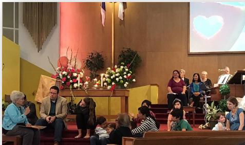
Children in Ministry

Sun, June 3 Worship and Communion Noon, Community Outreach (p.1) Noon, Best and Youth Groups (p.4) Mon, June 4 6:00 pm, Al-Anon Wed, June 6 11:30 am, Scripture & Sermon Study 5:30 pm, SD Project Grace 6:00 pm, Scripture & Sermon Study Thurs, June 7 7:00 pm, Choir rehearsal Fri, June 8 7:30 pm, Narc Anon Sat, June 9 10:00 am, Scripture & Sermon Study at PB UMC Lanai