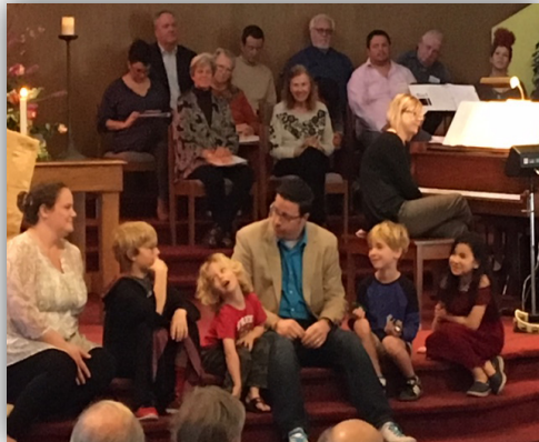
Our Children in Worship

Thurs, Mar 1 7:00 pm, Choir rehearsal Fri, Mar 2 Youth, Bishop Confirmation Retreat (p.4) 7:30 pm, Narc Anon Sat, Mar 3 9:00 am, Prayers & Squares Quilters 10:00 am, Scripture & Sermon Study at PB UMC Lanai