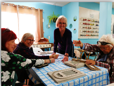
February 17, 2018 Ladies Event

Sun, Mar 4 Worship & Communion Youth Sunday School Mon, Mar 5 6:00 pm, Al-Anon Wed, Mar 7 11:30 am, Scripture & Sermon Study 5:00 pm, Books, Movie, and Writing Club 5:30 pm, SD Project Grace 6:00 pm, Scripture & Sermon Study Thurs, Mar 8 7:00 pm, Choir rehearsal Fri, Mar 9 7:30 pm, Narc Anon Sat, Mar 10 10:00 am, Scripture & Sermon Study at PB UMC Lanai