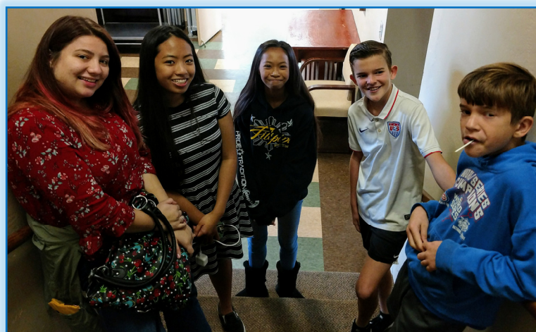
PB UMC Youth — 2017

Sun, Jan 14 Worship Ladies Lunch after church (p.3) Youth serve ISN guests (p.4) Mon, Jan 15 6:00 pm, Al-Anon Wed, Jan 17 11:30 am, Scripture & Sermon Study 5:30 pm, SD Project Grace 6:00 pm, Scripture & Sermon Study Thurs, Jan 18 7:00 pm, Choir rehearsal Fri, Jan 19 7:30 pm, Narc Anon Sat, Jan 20 9:00 am, Prayers & Squares Quilters 10:00 am, Scripture & Sermon Study at PB UMC Lanai