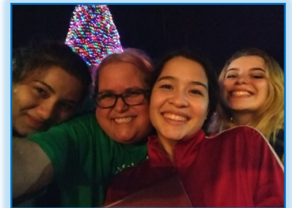
Wed Night Dinner Helpers