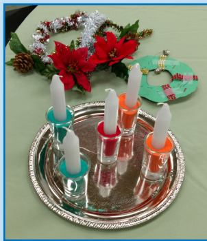
Advent Kick-Off Crafts