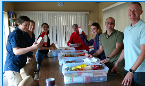
Preparing Christmas Baskets — 2017

Generous givers provided baskets of groceries with $35 gift cards for a family of five (which received two baskets), two families of four, a household of two seniors, and a single adult. Your contributions enabled us to buy another fifteen gift cards. Two of them went to individuals in our own congregation. The rest will provide Christmas cheer to families who were too late to sign up for baskets through CCSA. So much Christmas cheer! Thank you.