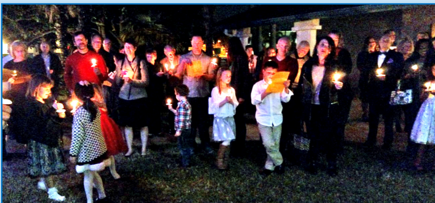
Christmas Eve Worship