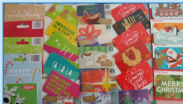
Gift cards from Target, Ralphs, Starbucks, McDonald's, and Jamba Juice for the Storefront teens. All thanks to the generosity of our congregation — 2017

Sun, Jan 21 Worship Youth Deetour challenge (p.4) Mon, Jan 22 February Beach Breeze Deadline 6:00 pm, Al-Anon Wed, Jan 24 11:30 am, Scripture & Sermon Study 5:30 pm, SD Project Grace 5:30 pm, Storefront Ministry Fri, Jan 26 7:30 pm, Narc Anon Area Youth Retreat (p.4) Sat, Jan 27 10:00 am, Scripture & Sermon Study at PB UMC Lanai Interfaith Shelter Guests Depart