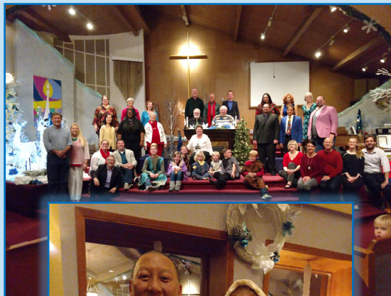
Christmas Musical — 2017