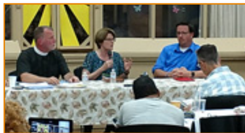
Speakers at "Clobber Passages" Workshop, September 17, 2017

Sun, Oct 1 Worship Noon, Youth Lunch Out (p.4) Mon, Oct 2 6:00 pm, Al-Anon Wed, Oct 4 11:30 am, Scripture & Sermon Study 5:00 pm, Books, Movie, and Writing Club (p. 6) 5:30 pm, SD Project Grace 6:00 pm, 1 st & 3 rd Wed. Eve Bible Study (p.4) Thurs, Oct 5 7:00 pm, Choir rehearsal Fri, Oct 6 7:30 pm, Narc Anon Sat, Oct 7 9:00 am, Prayers & Squares Quilters 10:00 am, Bible Study at PB UMC Lanai