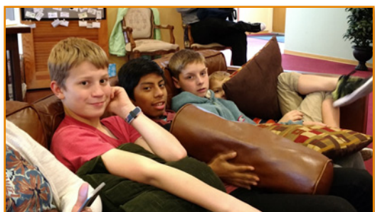
Some of Our Youth — 2017

Sun, Oct 8 Worship 2:00 pm, Second Sunday Concert (p.5) 4:30 pm, Youth Dinner and Games (p.4) Mon, Oct 9 6:00 pm, Al-Anon Tues, Oct 10 6:00 pm, Staff Parish meeting 6:30 pm, Trustee meeting 7:30 pm, Finance Committee Wed, Oct 11 11:30 am, Scripture & Sermon Study 5:30 pm, SD Project Grace Thurs, Oct 12 7:00 pm, Choir rehearsal Fri, Oct 13 7:30 pm, Narc Anon Sat, Oct 14 10:00 am, Bible Study at PB UMC Lanai 10:00 am, Ladies Brunch at Swami's (p.3)