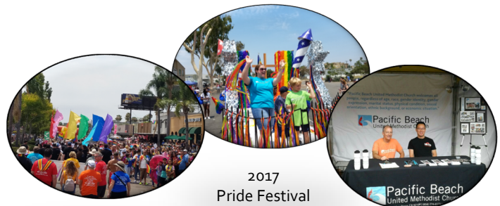
2017 Pride Festival

The other story is just funny.....A lady ran out to the float and yelled, "Your float is so much prettier than Macy's!" which was right in front of ours....lol. The crowd really responded to the presence of a church float in the Pride Parade. Lots of cheers and "Thank you for being here" rang out all along the route. Jesus had a presence and celebrated Pride that day, praise the Lord.