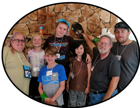
Camp Cedar Glen 2017 Elementary School Attendees and Counselors

Sun, Aug 6 Worship 12:30 pm, GriefShare Mon, Aug 7 6:00 pm, Al-Anon Tues, Aug 8 6:30 pm, Trustee meeting 7:30 pm, Finance Committee Wed, Aug 9 5:30 pm, SD Project Grace Thurs, Aug 10 9:00 am, Youth Day at Beach (p. 4) 5:15 pm, Handbell Choir rehearsal 7:00 pm, Choir rehearsal Fri, Aug 11 7:30 pm, Narc Anon Sat, Aug 12 10:00 am, Bible Study at PB UMC Lanai 10:00 am, Ladies' Brunch —(p. 3)