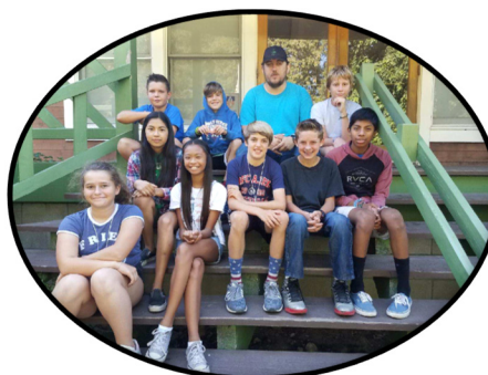
2017 Junior High Camp

Sun, Aug 27 Worship 12:30 pm, GriefShare Mon, Aug 28 6:00 pm, Al-Anon Tues, Aug 29 9:00 am, September Beach Breeze Folding Party (Note Date Change) Wed, Aug 30 5:30 pm, SD Project Grace Thurs, Aug 31 5:15 pm, Handbell Choir rehearsal 7:00 pm, Choir rehearsal