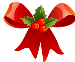
Beach Breeze 7

Sun, Dec 25 10:00 am Worship (one service) (p.1) Mon, Dec 26 6:00 pm, Al-Anon Tues, Dec 27 9:30 am, Beach Breeze Folding Party Wed, Dec 28 5:30 pm, Storefront Ministry 5:30 pm, SD Project Grace Thurs, Dec 29 10:30 pm, District youth Lock-In (p.4) Fri, Dec 30 7:30 pm, Narc Anon