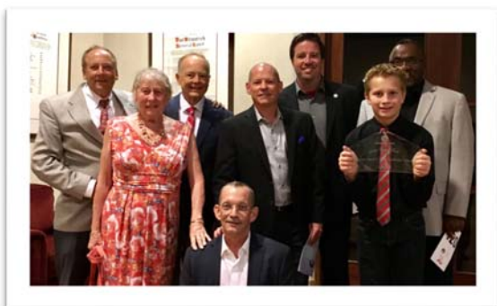
PB UMC Received an Award From the Interfaith Shelter Network at a Gala On September 24, 2016.

Sat, Oct 1 9:00 am, Men's Prayer & Share 9:00 am, Prayers & Squares Quilters 11:30 am, Ladies Lunch (p. 3) 12:30 pm, Camp Cedar Glen Open House (p. 4)