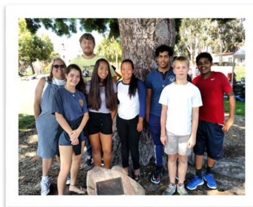
Youth Group September 2016

Sun, Oct 16 Worship 4:00 pm, UMYF (p. 4) 12:30, GriefShare 5:00 pm, Christmas Musical Rehearsal Mon, Oct 17 Beach Breeze Deadline 6:00 pm, Al-Anon Wed, Oct 19 5:30 pm, SD Project Grace Thurs, Oct 20 5:15 pm, Hand Bell rehearsal 7:00 pm, Choir rehearsal Fri, Oct 21 7:30 pm, Narc Anon Sat, Oct 22 9:00 am, Men's Prayer & Share