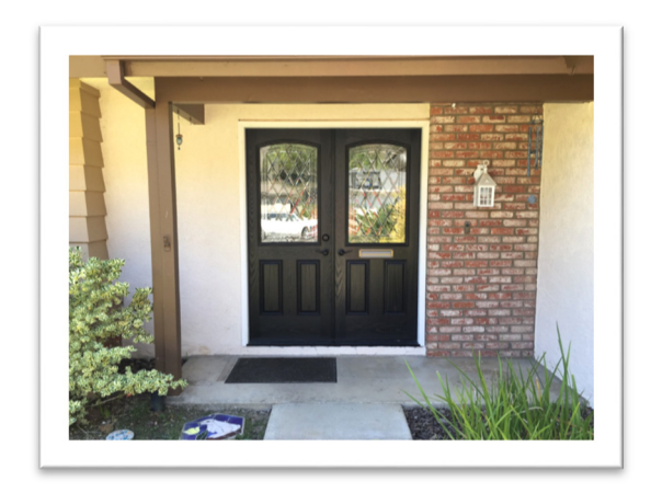
New Front Doors at Parsonage

10:00 am, Christmas Musical Auditions (pg 1)